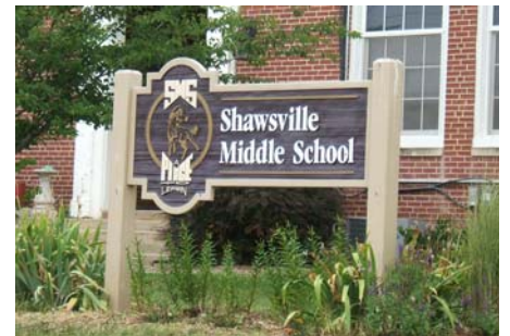
Shawsville Middle School hosts the Boys & Girls Club where the Values in Alignment process is being rolled

"Reinforcing the values of achievement, responsibility, and integrity will be challenging, but should yield some positive results."